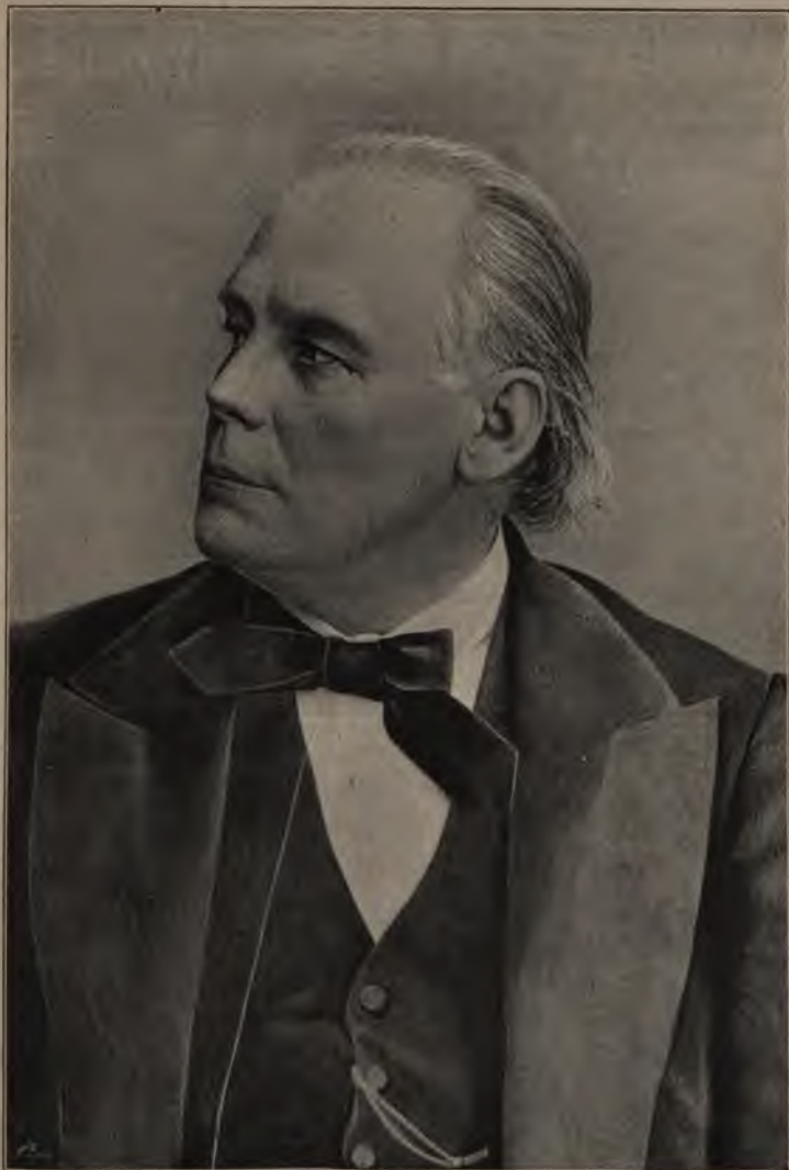
CHARLES BRADLAUGH, M.P.